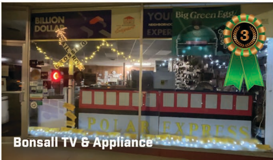
Bonsall TV & Appliance

Dunlap businesses decorated their windows and storefronts in the "Polar Express" theme ahead of the Dunlap Shop Hop.