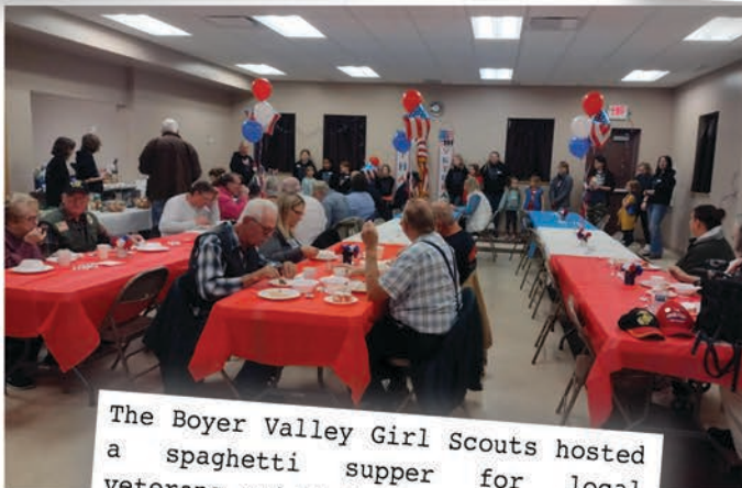
The Boyer Valley Girl Scouts hosted a spaghetti supper for local veterans and their guests.