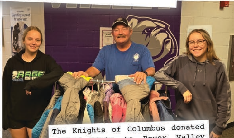
The Knights of Columbus donated winter coats to Boyer Valley Schools.