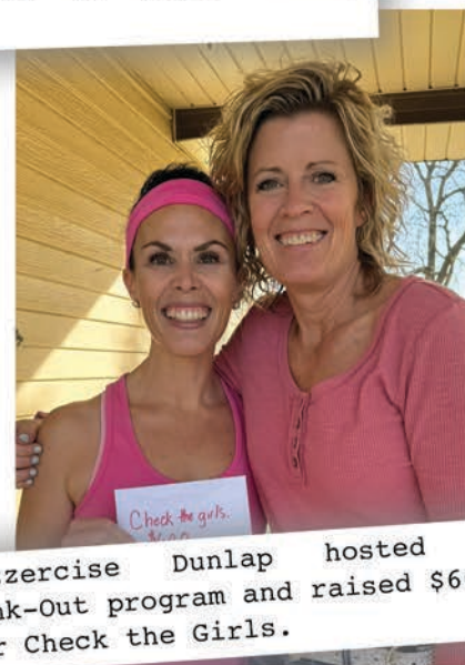
Jazzercise Dunlap hosted a Pink-Out program and raised $600 for Check the Girls.