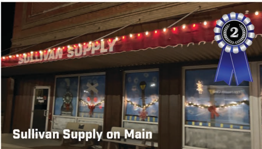
Sullivan Supply on Main