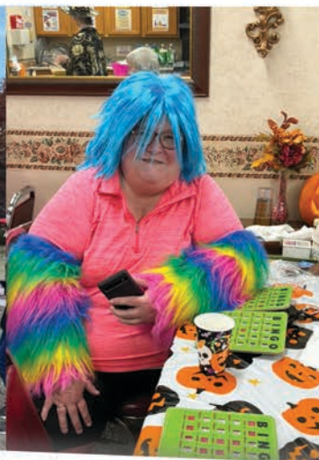
Angels Care Home Health sponsored a Halloween Costume Party at the Dunlap Senior Center.