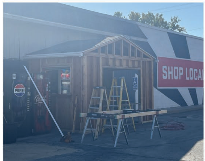
Smitty's Grocery had their entryway repaired.