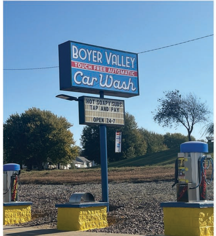
The Boyer Valley Touch Free Automatic Car Wash updated their marquee sign.