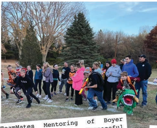
TeamMates Mentoring of Boyer Valley hosted a successful Spooky Run fundraiser.