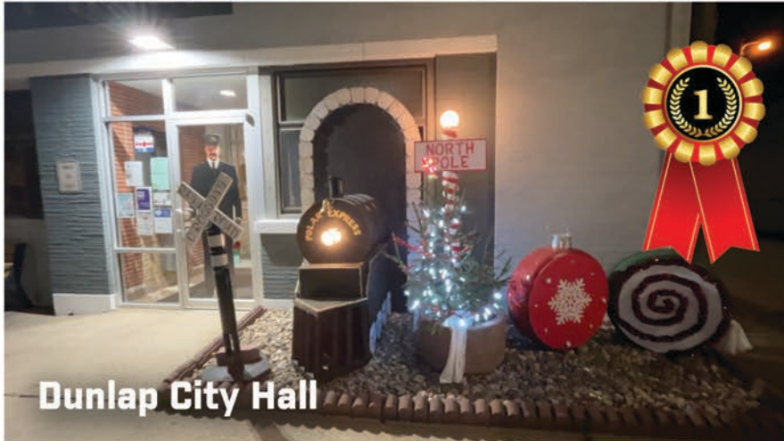
Dunlap City Hall