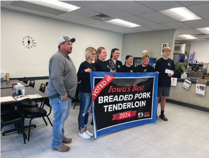
The Dairy Sweet was recently named "Iowa's Best Breaded Pork Tenderloin" of 2024 by the Iowa Pork Association.