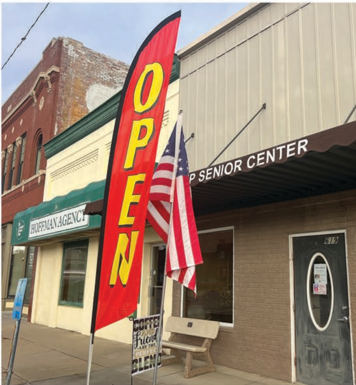
The Dunlap Senior Center has been trying many new things to drive more traffic to their noon meal offering. They have received helpful donations from the Dairy Sweet (open flag), Bonsall TV & Appliance (vacuum), and Dunlap Lumber (supplies and tools.)